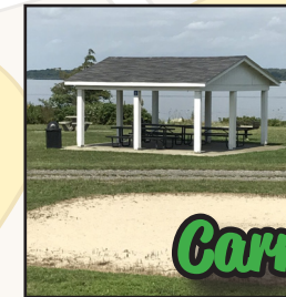
Carr Point Rec Area