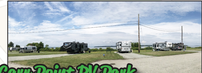
Carr Point RV Park